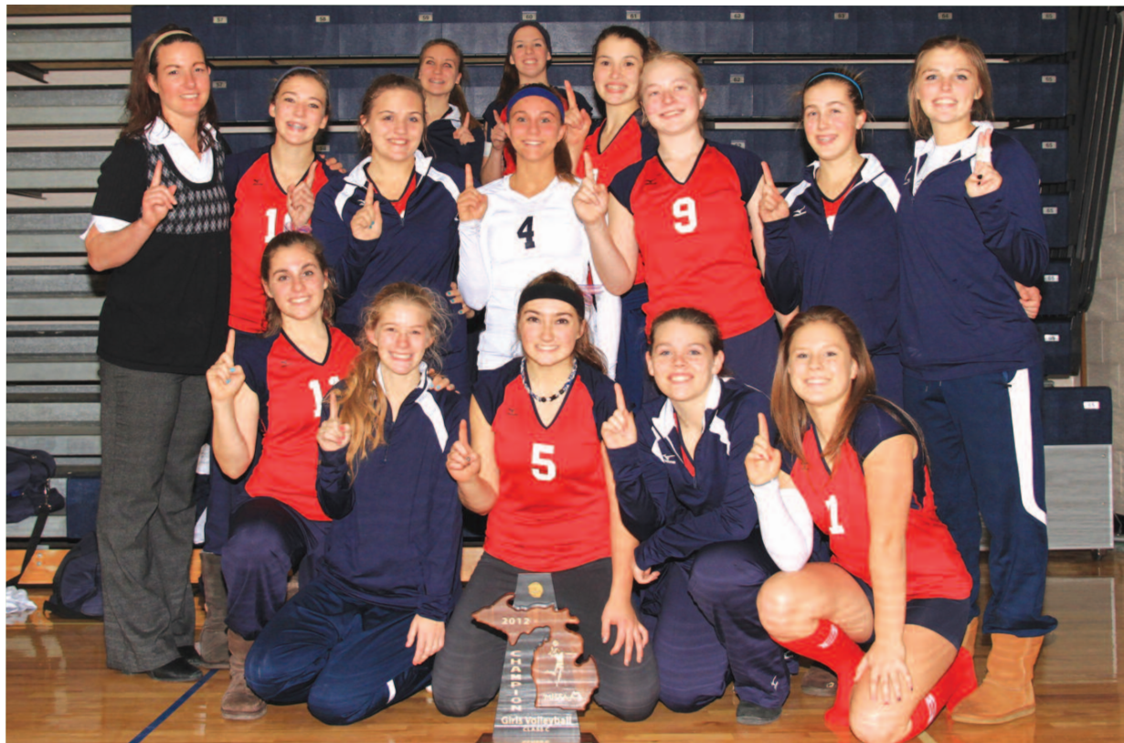
The 2012 District Champion volleyball Boyne City Ramblers.