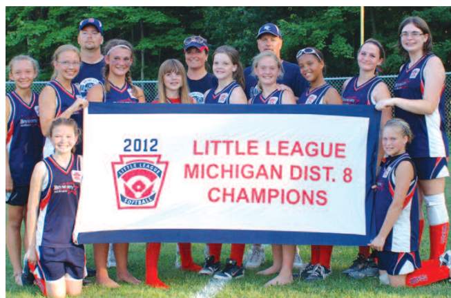
The 2012 Boyne City Little League Major (11-12) girls district champions.