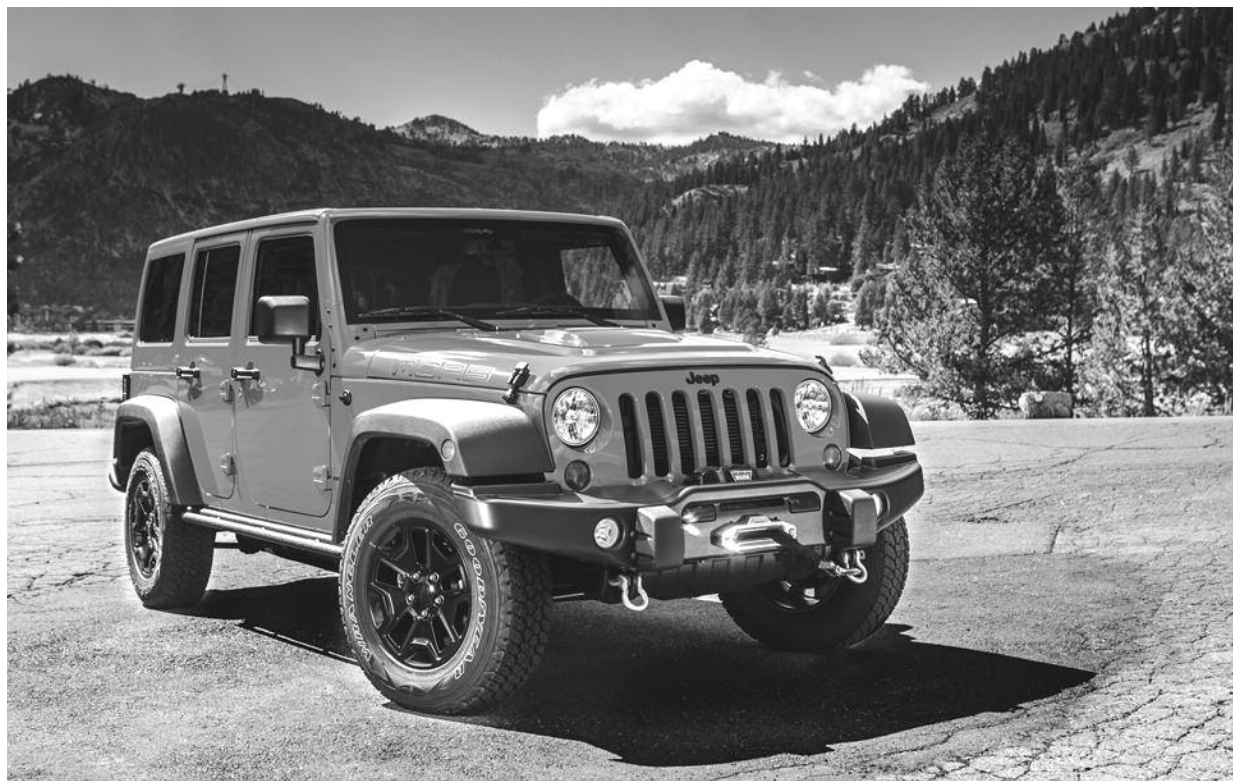
The 2013 Jeep® Wrangler Unlimited Moab Edition, shown here with the new Rock Lobster paint color, is the winner of the respected "Four Wheeler of the Year" award from the editors of Four Wheeler magazine.