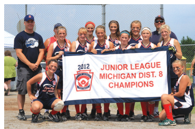
2012 Boyne City Little League girls' junior (13-14) softball division district champions.