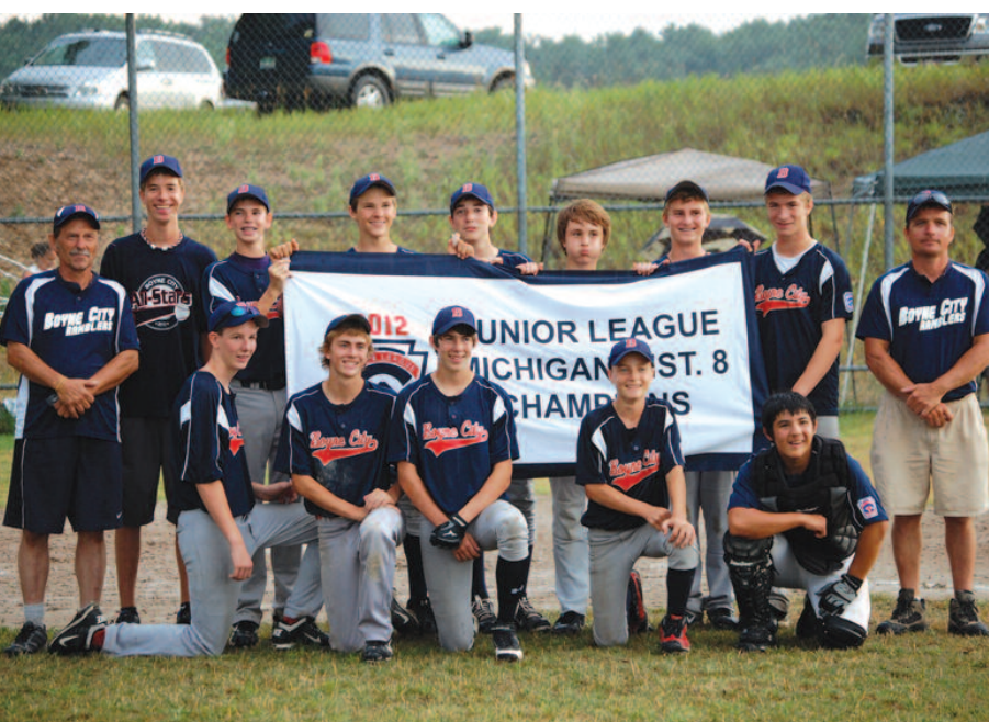
The 2012 Boyne City Little League boys' junior (13-14) division district champions.