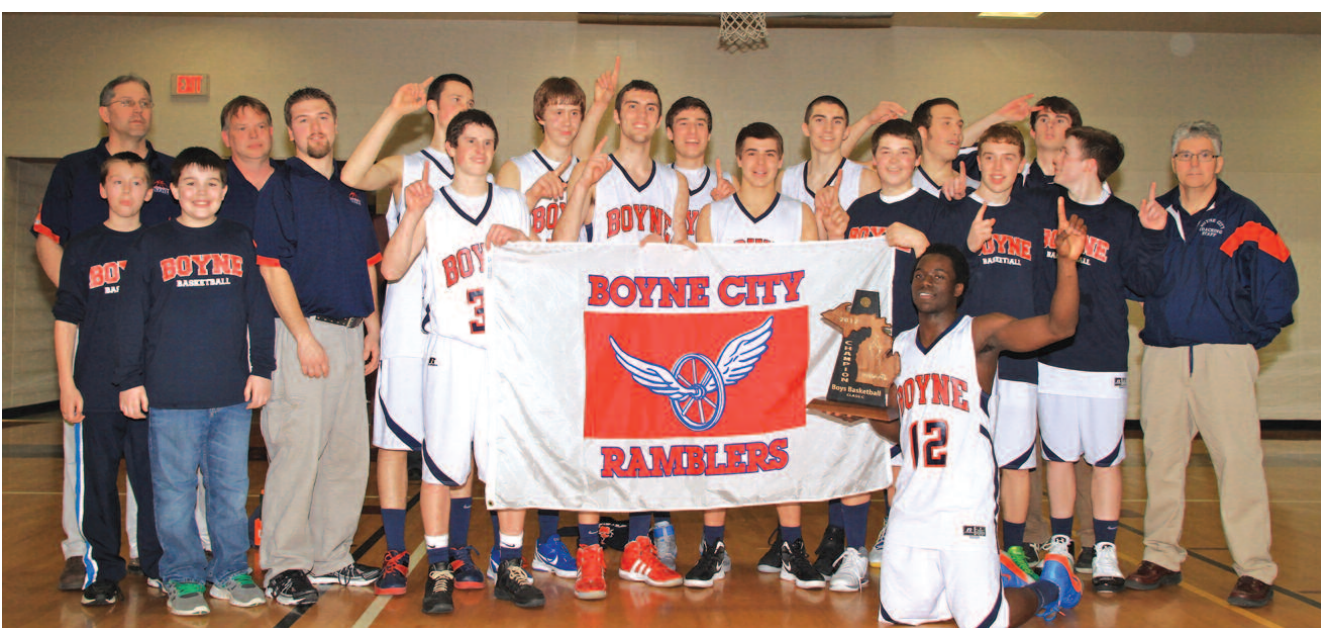
The Boyne City Ramblers boys' basketball team celebrates their district crowning following their victory over Elk Rapids.